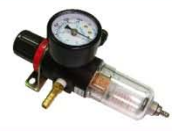
AFR-200-H(SWA) 調壓閥 Regulator