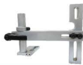
SAH-1102-50 支架 Bracket